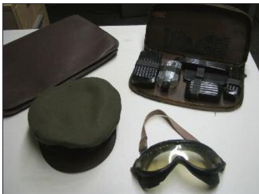
Below: Aerial essentials from the Vanitzian Collection