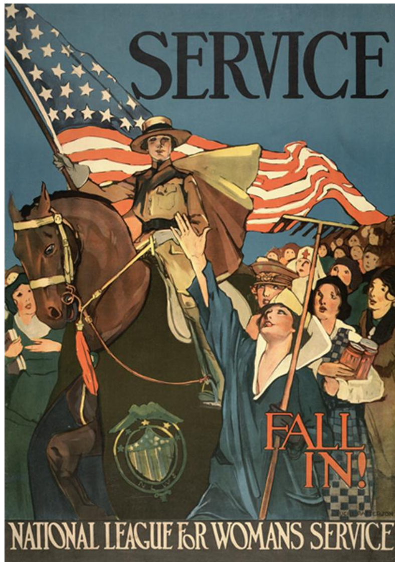
Fig.8: Service: fall in!

World War I saw unprecedented participation of women in war efforts. Over 20,000 nurses would serve both stateside and abroad. Beyond the nursing field however, women were also involved in switchboard operation, clerical work, and stenography. With their skills now being used in positions normally held by military men, those men were free to fight in the war. The Navy enlisted 11,880 women as Yeomen and even the Marines signed up 305 women to do clerical work normally assigned to males. While they would be considered employees of the armed services and not full members in them, this did not deter these women's eagerness to aid the war effort. Even outside of the military structure women such as those involved with the National League For Women's Service provided important assistance for servicemen. These women performed functions such as serving food to enlisted men before they shipped out and driving men to enlistment locations.