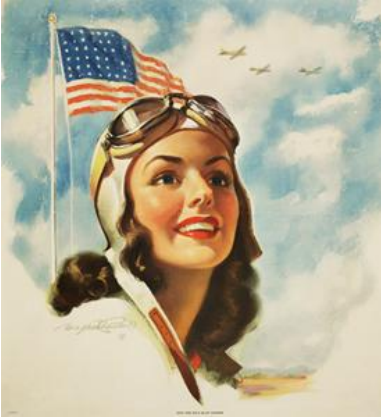
Fig.7: Into the wild blue yonder