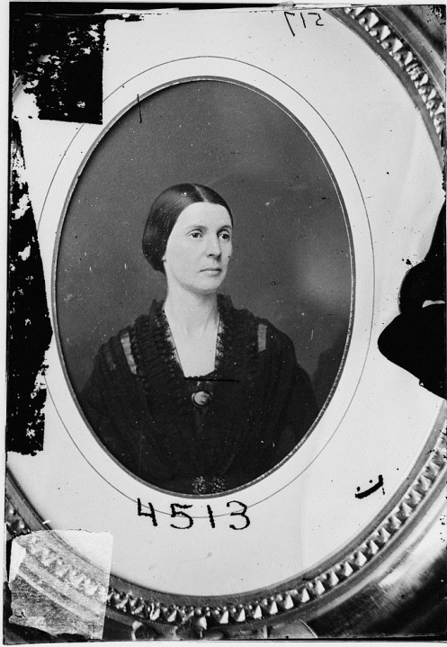
Fig.5: Mrs. Rose Greenhow

The struggle between North and South in the Civil War resulted in espionage by both sides, thus propelling the use of women as spies whose traditional feminine, gentle, and flirtatious stereotypes aided them in their ability to obtain and transport military secrets across enemy lines. The most famous woman in this role was a Washington socialite, the widow Rose Greenhow, who created an extensive spy network and held close counsel with various federal officials in Washington. She obtained important intelligence on behalf of her beloved South. Most notably in the Civil War, women's contributions in medical care would lead to breakthroughs like the appointment of the Army's first female physician, Dr. Mary E. Walker (first female Medal of Honor recipient). While again these nurses, doctors, spies, and soldiers were not officially recognized as members of the military, their accomplishments in all of these fields would lead to further breakthroughs for women in the coming century, not to mention prove vital to the war efforts.