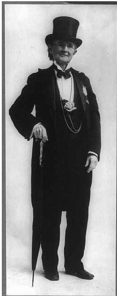
Fig.6: Mary Edwards Walker

The struggle between North and South in the Civil War resulted in espionage by both sides, thus propelling the use of women as spies whose traditional feminine, gentle, and flirtatious stereotypes aided them in their ability to obtain and transport military secrets across enemy lines. The most famous woman in this role was a Washington socialite, the widow Rose Greenhow, who created an extensive spy network and held close counsel with various federal officials in Washington. She obtained important intelligence on behalf of her beloved South. Most notably in the Civil War, women's contributions in medical care would lead to breakthroughs like the appointment of the Army's first female physician, Dr. Mary E. Walker (first female Medal of Honor recipient). While again these nurses, doctors, spies, and soldiers were not officially recognized as members of the military, their accomplishments in all of these fields would lead to further breakthroughs for women in the coming century, not to mention prove vital to the war efforts.