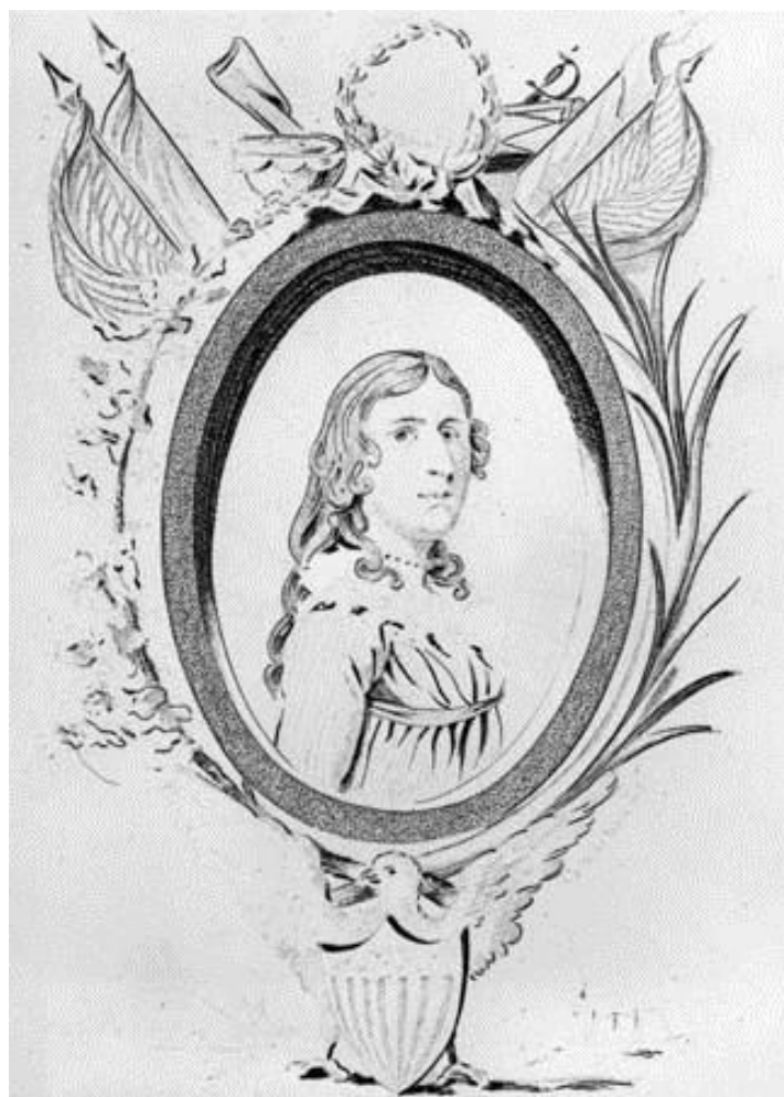
Fig. 2: Deborah Sampson [sic]

The late eighteenth and the nineteenth century up until the Civil War saw repeated instances in which women masqueraded as men to serve in American wars. This period saw women actively supporting their respective causes through boycotts of British goods during the American Revolution and serving as nurses during the Civil War. However, direct involvement in the armed forces had to come through deception as enlistment was limited to males. While it is difficult to assess exact numbers for nurses and camp followers during these wars, it is even more difficult to figure out precisely how many women served under the guise of men. The first known instance of a woman dressing as a man for military service was Deborah Sampson (often misspelled as Sampson), a Massachusetts woman, who enlisted in the Continental Army in 1782 at the age of 21 as Robert Shurtliff. Serving for approximately seventeen months Sampson saw several battles, was wounded twice, and was discovered to be a woman when doctors treated her due to complications following her second wound. She was honorably discharged and received minor acclaim, plus a pension, after her story became popular in the years after the war.