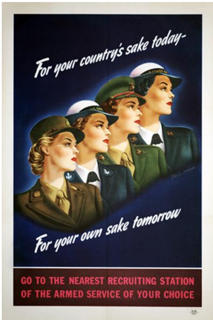
Fig.9: For your country's sake today, for your own sake tomorrow: go to the nearest recruiting station of the Armed Service of your choice

The outpouring of patriotism that accompanied the United States' entry into World War II led to a flood of enlistments by both men and women across the country. Even more so than in World War I, the number of women willing and eager to serve ballooned. And in the end the country's need to quickly militarize, as well as prepare and deploy its forces, led to the inclusion of women in various branches of the military in areas they had never before been allowed. 60,000 Army nurses served; the Women's Army Corps (WAC) was established with 150,000 enlistees. Women Airforce Service Pilots (WASPs) would fly various domestic missions. 80,000 women joined the Navy's Women Accepted for Volunteer Emergency Service (WAVES), and the Marine Corps Women's Reserve also relied heavily on women so as to "free men to fight." While most of these women were mustered out after the war, their service was invaluable and led to legislation in 1947-48 that was the start of allowing women to serve in the military with equal privileges and rankings in times of peace as well as war. Gone were the days of their service being viewed as contract employment for the military. However, their full integration in combat units remained incomplete.